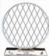
AL DAR SALES PERFORMANCE AWARD 1ST PLACE - 2018