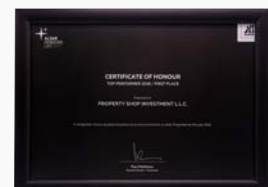
AL DAR TOP PERFORMING AGENCY 1ST PLACE - 2016