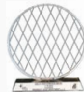
AL DAR TOP PERFORMER 2017