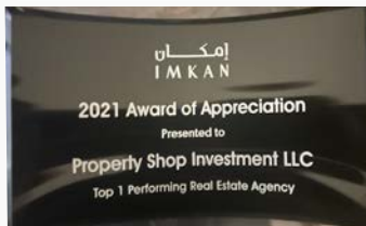
IMKAN TOP PERFORMING AGENCY 1ST PLACE - 2021